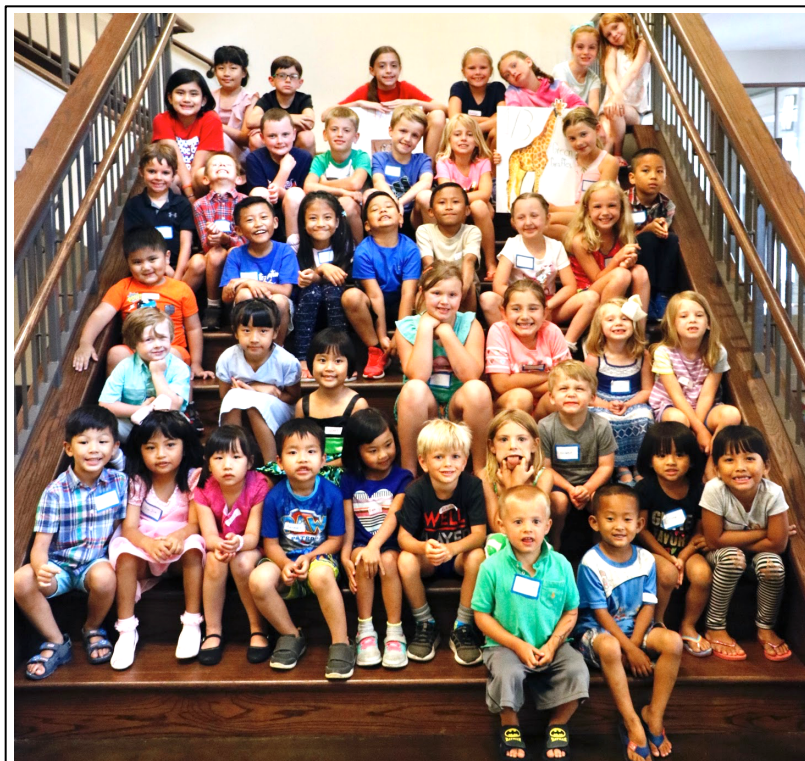
Pictured above are many of the children who attended VBS.

Thank you to everyone who helped make VBS a wonderful experience.